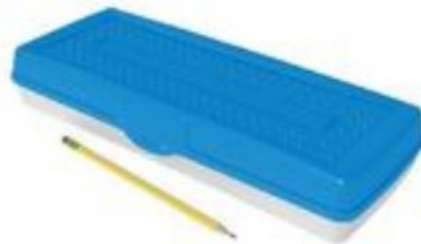
Large hard pencil case