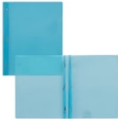
Plastic pocket duotangs, no pockets.