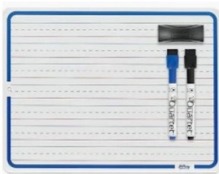
Personal White board, does not need to be lined