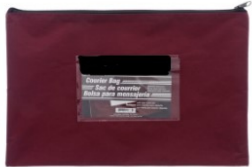
Zipper Courier /Deposit Bag 14" x 10"