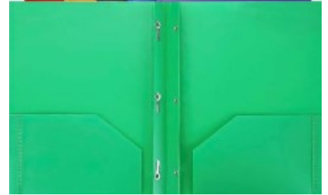
Plastic Duotang with a pocket