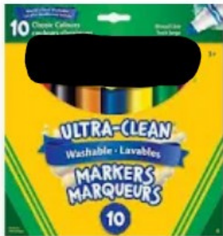
Markers (unscented, 10 pack)