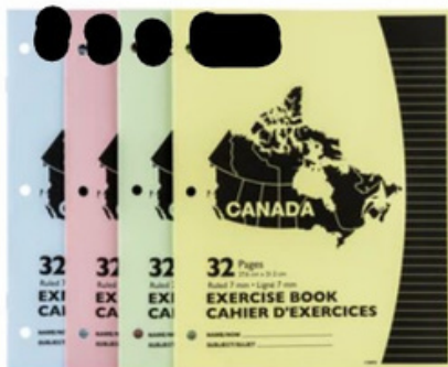
Hilroy type exercise books/scriblers, 32 pg ea If Possible 1 pkg of 4 of Blue, Pink, Green and Yellow